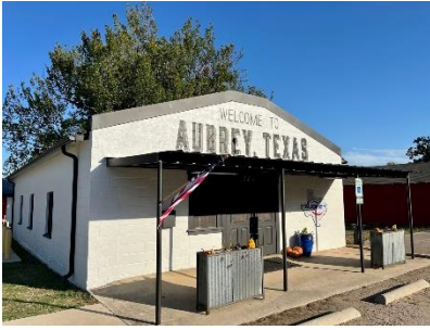
Front of building