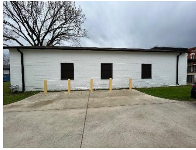
Northside wall of building