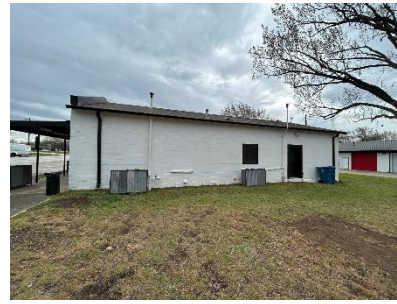
Southside wall of building

About the Project: The Aubrey Municipal Development District (“MDD”) Building, which also houses the Chamber of Commerce, is seeking artist qualifications and proposals (“Proposals”) for a mural project on the north and sides of their building on Main Street in Aubrey (“Project”). The mural wall surface is painted concrete block. The north wall has 3 windows, and the dimension of the entire wall is 10’ 9” tall by 50’ 1” wide (see last page for specs on windows and gutters). The south wall has 1 window and 1 door and is 10’ 1” to 10’ 9” tall due to foundation depth at the back end of the building and it is 50’ 1” wide (see last page for specs). Applicants must submit Proposals for the north wall, but may choose to also add a submission for the south wall.